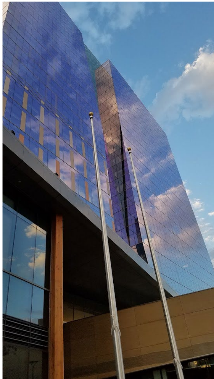
New Natural Resources Building 715 P Street, Sacramento